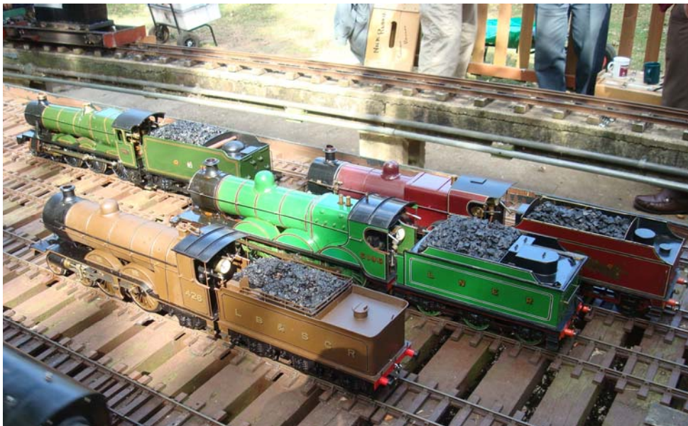
Some club members loco's waiting to run at Colney Heath, including a GWR 'County', LMS 'Midland Compound', LNER 'B15', and LB&SCR 'Atlantic'

(ed Apologies to the Garden Rail Section for the mix up that resulted in their report not being published last month)