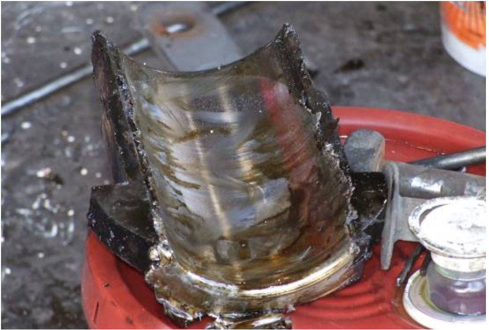
Bottom left: Engineers disassembling a bogie to repair a “hot box” suffered on the previous days service from Chama to Antonito. Above: The melted axle box white metal bearing. Below: The completed bogie.