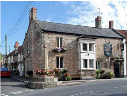
Left The Bull Terrier at Croscombe

The Bristol SMEE exhibition was pretty good too!