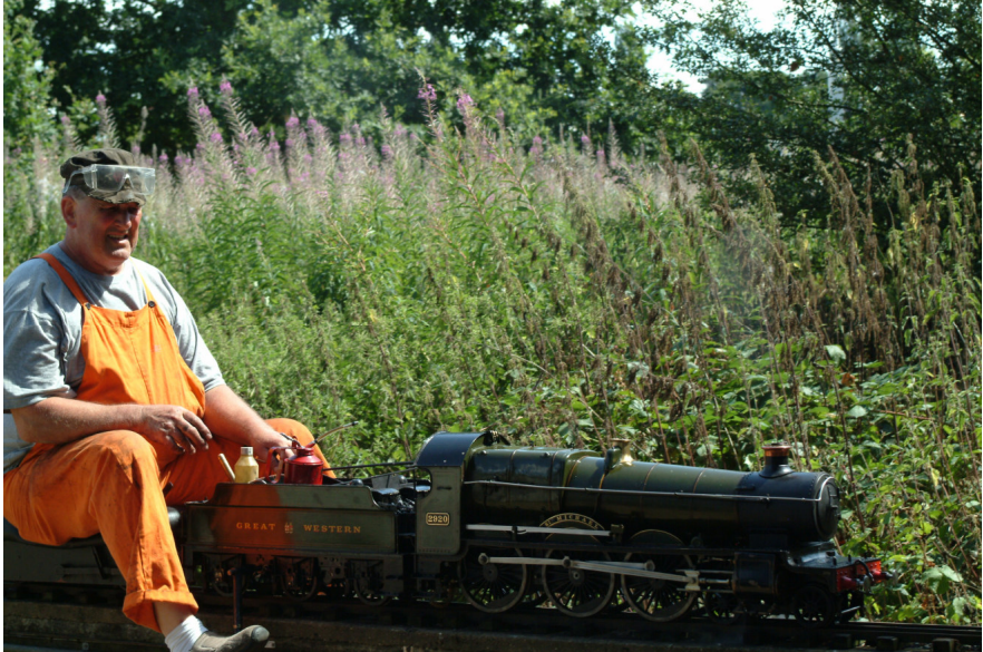
Saint Class 4-6-0 No. 2920 'St David' masquerading as 'St Michael'!

Awoke at seven to a warm and sunny July Saturday morning. After stretching realized that this was the day that had been set aside for the visit to NLSME by the respected Model Engineering Club of Northolt.