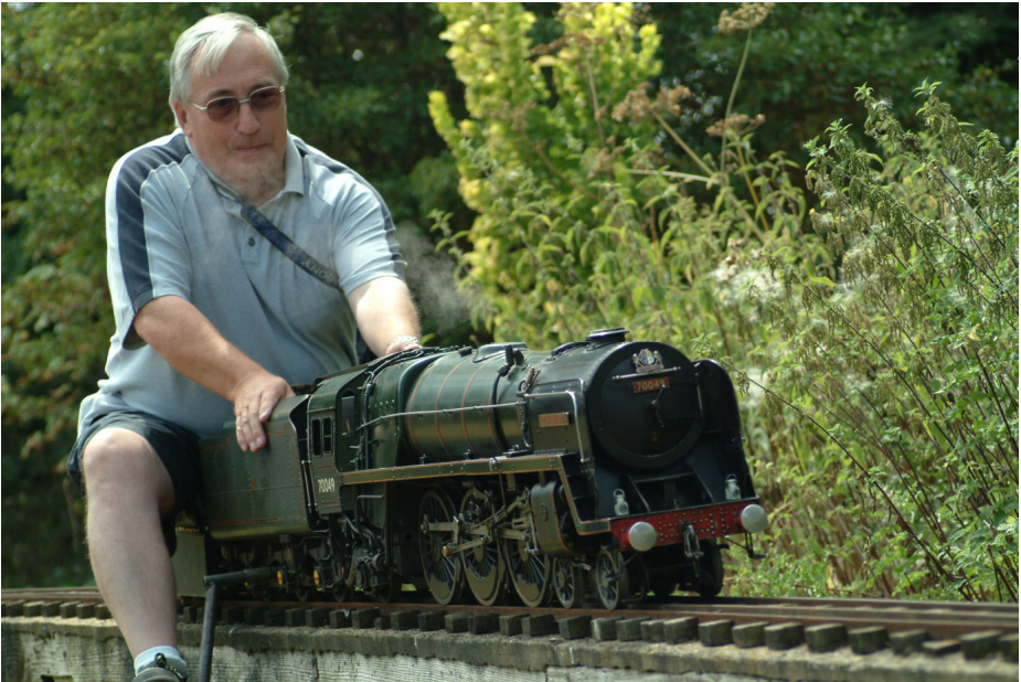
Britannia Class 4-6-2 No. 70049 'Solway Firth' heads down the raised track, light engine.

An excellent time was had by visitors and visited alike. The challenge of the lengthy and the mild gradients of our track stimulated all the parties. Pleasant stops were made for fresh morning drinks, plenteous lunch and welcome afternoon teas. Such that we, both hosts and hosted had a very gratifying and stimulating time.