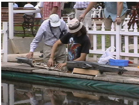
The Robbe U-47

installed to ensure a constant circulation of the water.