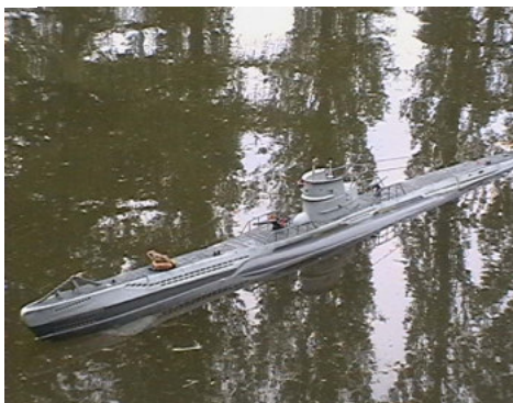
Frog steals a ride!

Fortunately none of our open days was adversely affected by algae problems in the pool and all three events were successful. My particular thanks to Andrew Lawrence for his organisation of the submarine day in June. A number of participants travelled some distance to attend the event including one driving down from Blackpool early in the morning. There was an interesting range of submarines in action; some using dynamic diving as a means of submersion (ie., diving by increasing