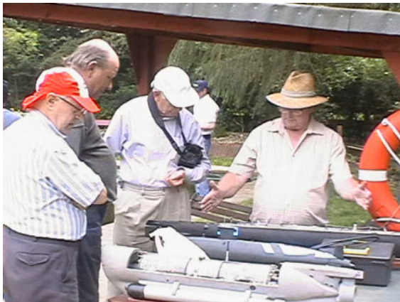
Discussions and advice beside the pool

Autumn 2006 marks the tenth anniversary of start of work on the boat pool at Tyttenhanger. When clearing my house for the move down to Eastbourne this summer I came across a few old photographs showing the early work on the project. Those of