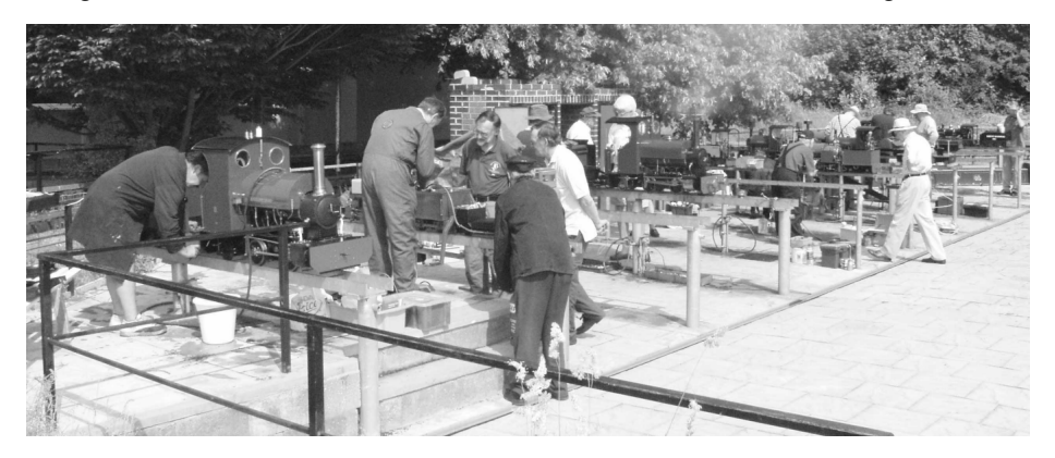
A busy scene in the steaming bays