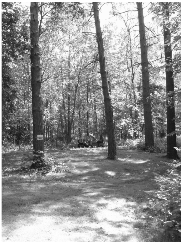
Pinewood Miniature Railway is set in the idyllic mature pine woodland surrounding Pinewood Leisure Centre between Wokingham and Crowthorne in Berkshire.